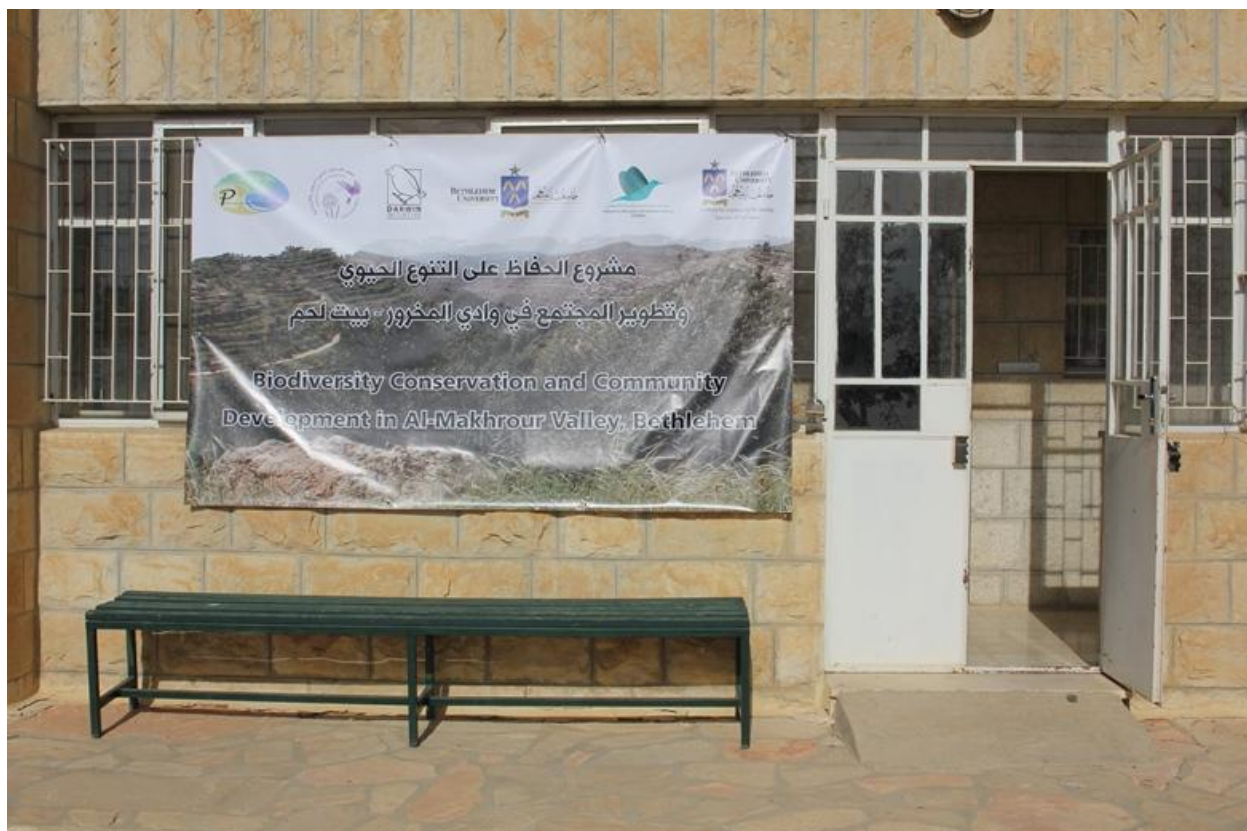
The project banner with Darwin Initiative logo.